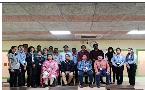
Celebration of International Day of Education at CUTM on dt.24.01.25.