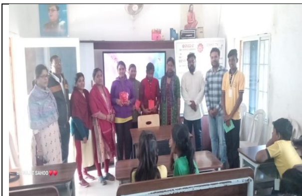
Health Awareness Program at Govt. U.G High School, Phulapokhari, Baranga, Cuttack on dt.14.12.2024.