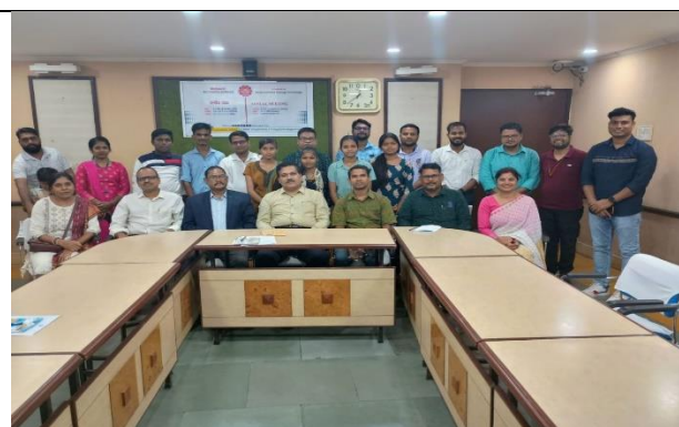
Annual Meeting of Gyanalok Trust on dt.14.07.24.