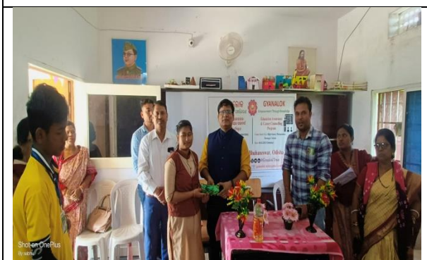
Career Counselling Program at Govt. U.G High School, Phulapokhari, Baranga, Cuttack on dt.08.02.25.