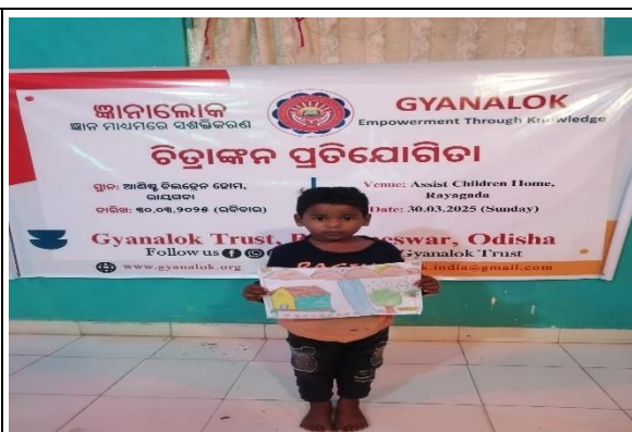
Drawing competition at Assist Children Home, Rayagada on dt.30.03.25.