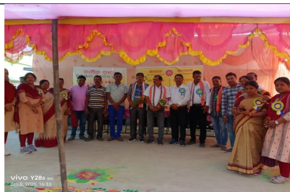
Annual Sports Program at Govt. U.G High School, Phulapokhari, Baranga, Cuttack on dt.08.01.25.