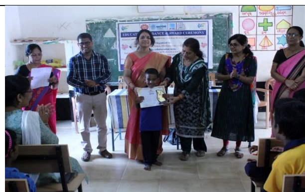
Celebrate Independence Day and National Social Work Week at Govt. Primary School, Niladri Vihar, Bhubaneswar on dt 15.08.24.