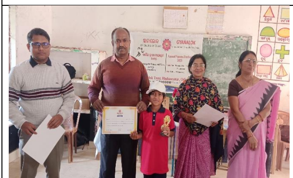
Annual Sports Program at Govt. Primary School, Niladri Vihar, Bhubaneswar on dt 11.01.25.