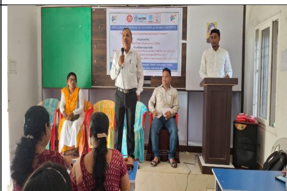
Celebrate Independence Day and National Social Work Week at Panchayat High School, Dharmasala, Ulunda, Sonepur on dt 15.08.24.