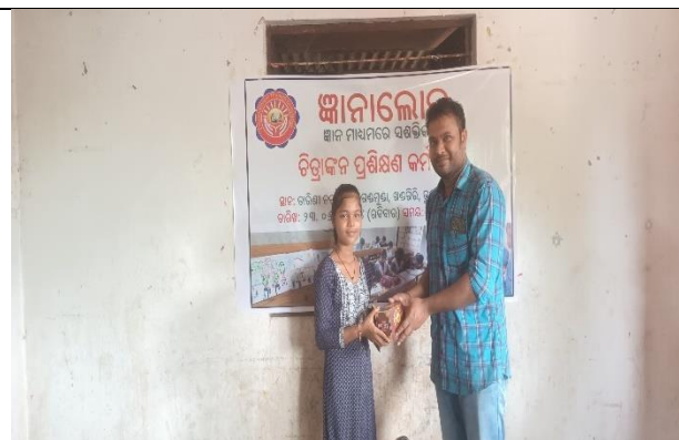
Drawing competition at Tarini Nagar Basti, Gandamunda, Bhubaneswar on dt.23.06.24.