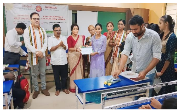
Scholarship Program at Govt. High School, Gandamunda, Khandagiri, Bhubaneswar on dt.13.07.24.