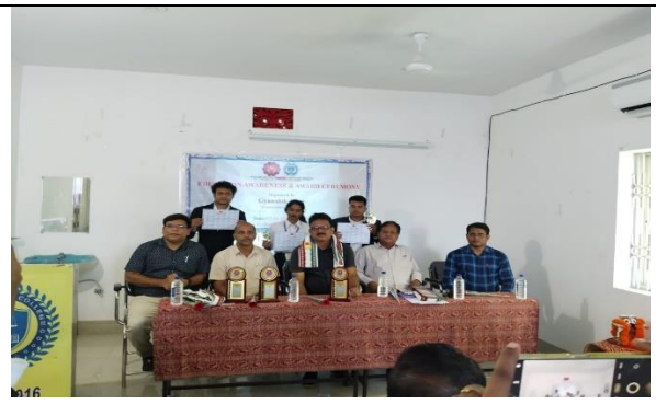
Education Awareness Program at Khordha Law College on dt.10.10.23