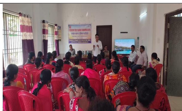
Grass Root Level Training Program at Mission Shakti Gruha, Ullunda, Sonapur on dt.05.03.2024