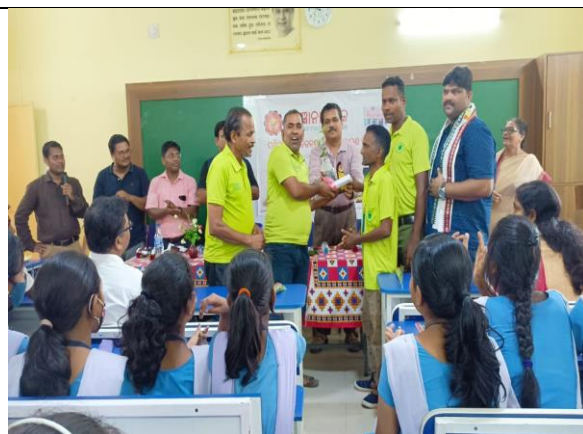
Environment Awareness & Tree Plantation Program at Govt. High School, Gandamunda, Khandagiri, Bhubaneswar on dt.01.07.2023.