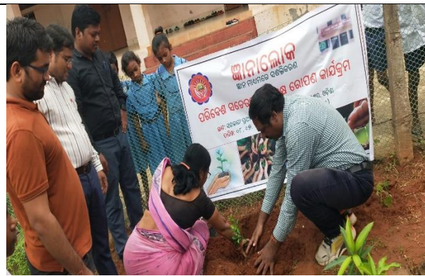
Environment Awareness & Tree Plantation Program at Govt. Primary School, Niladri Vihar, Bhubaneswar on dt.08.07.2023.