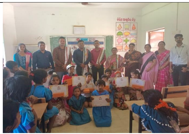
Celebrate National Social Work Week at Govt. Primary School, Niladri Vihar, Bhubaneswar on dt 19.08.24.