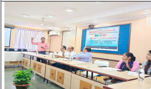
Annual Meeting of Gyanalok Trust on dt.09.07.23.