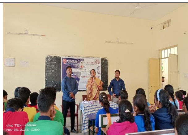
Health Awareness Program at Govt. High School, Gandamunda, Khandagiri, Bhubaneswar on dt.25.11.2023.