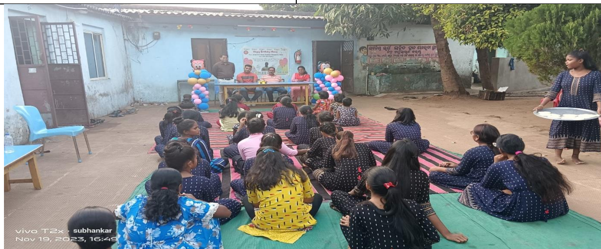
Education Awareness Program at Jeevan Jyoti Ashram, Khandagiri, Bhubaneswar on dt.19.11.2023