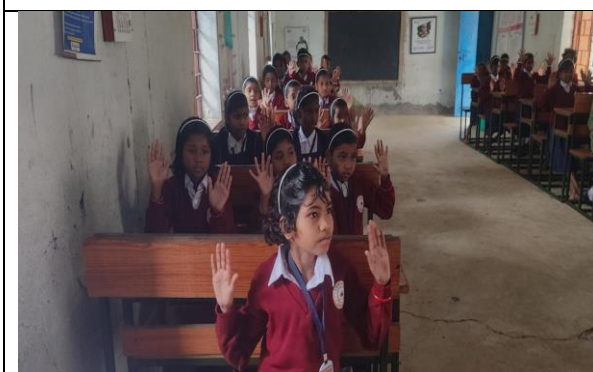
Celebrate Republic Day at Sebashram School, Daldaba, Ulunda, Sonapur on dt 26.01.2024.