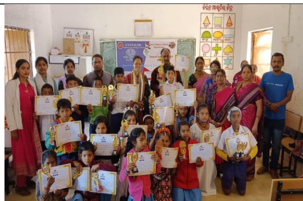
Republic Day & Annual Sports Program at Govt. Primary School, Niladri Vihar, Bhubaneswar on dt 26.01.24.