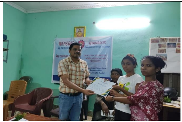
Scholarship Program at Assist Children Home on dt.23.07.23.