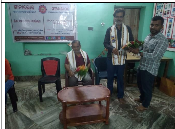
Carrer Counselling Program at Assist Children Home on dt.11.10.23.