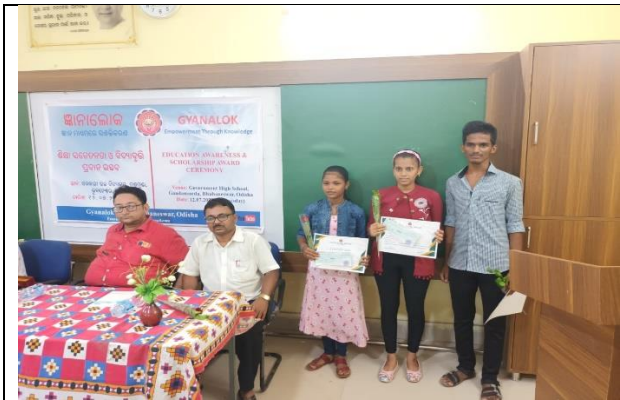
Scholarship Program at Govt. High School, Gandamunda, Khandagiri, Bhubaneswar on dt.12.07.23.