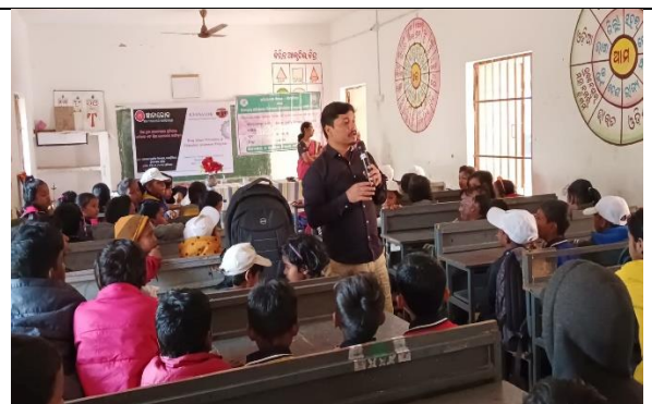
Health Awareness Program at Govt. Primary School, Niladri Vihar, Bhubaneswar on dt.13.01.2024.