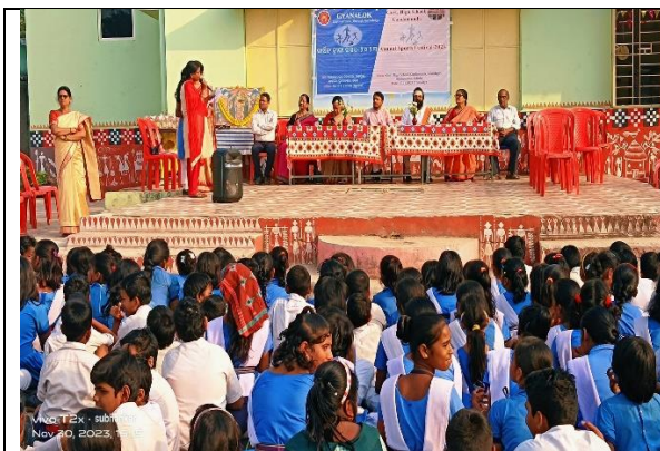
Annual Sports Program at Govt. High School, Gandamunda, Khandagiri, Bhubaneswar on dt.30.11.23.