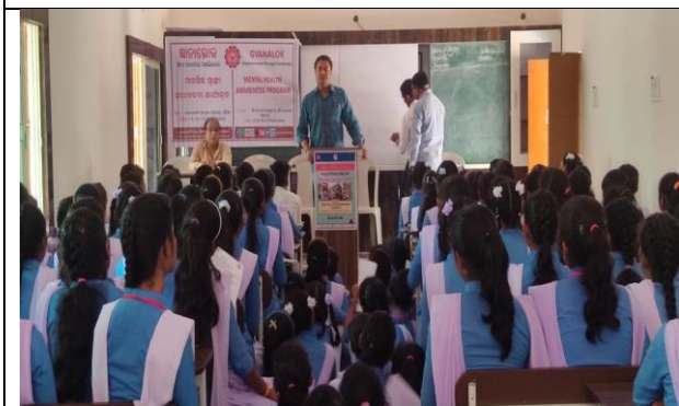
Health Awareness Program at Kasturba Gandhi Girls High School, Pujariguda, K.Singhpur, Rayagada on dt.11.10.2023.