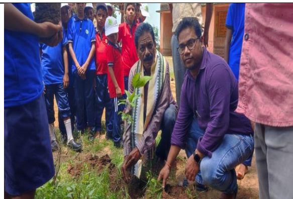
Environment Awareness & Tree Plantation Program at Govt. U.P School, Tikuda, Sonepur on dt.26.08.2023.