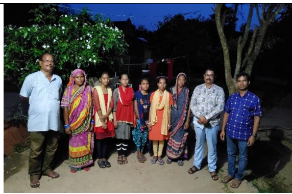
Students supported monetarily for higher education