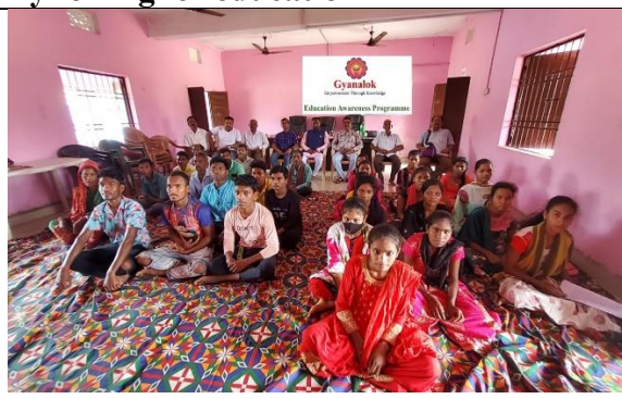
Education awareness at Banapur, Khrodha