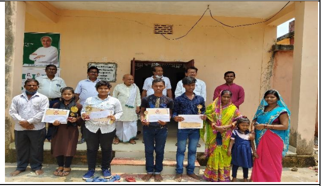
Children felicitated at PPBM, High School, G. Munda