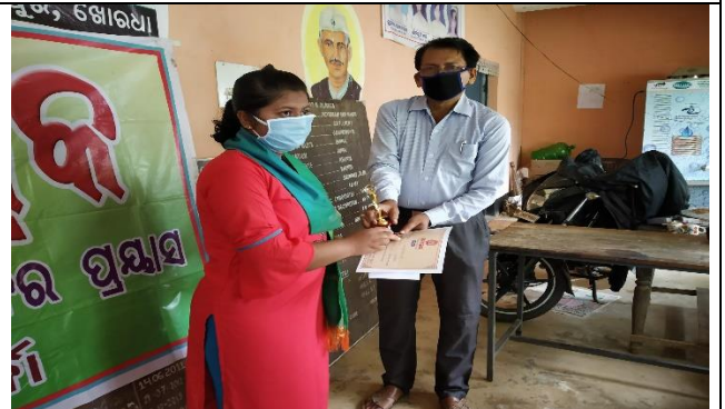
Prize Distribution at PPBM, High School, G. Munda