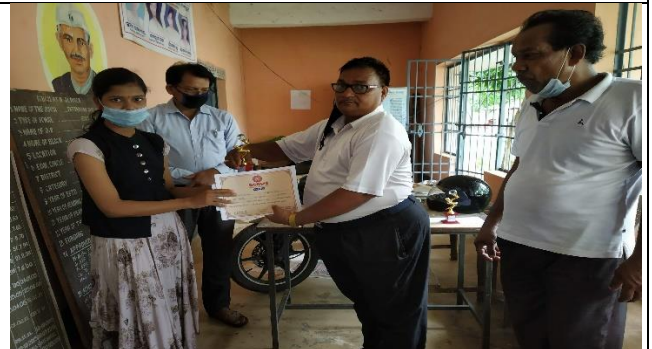
Prize Distribution at PPBM, High School, G. Munda