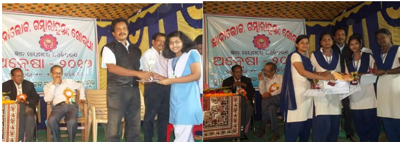
Felicitation to the students