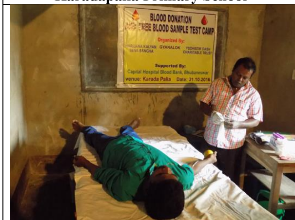
Health & blood donation camp were organised at Karadapalla village