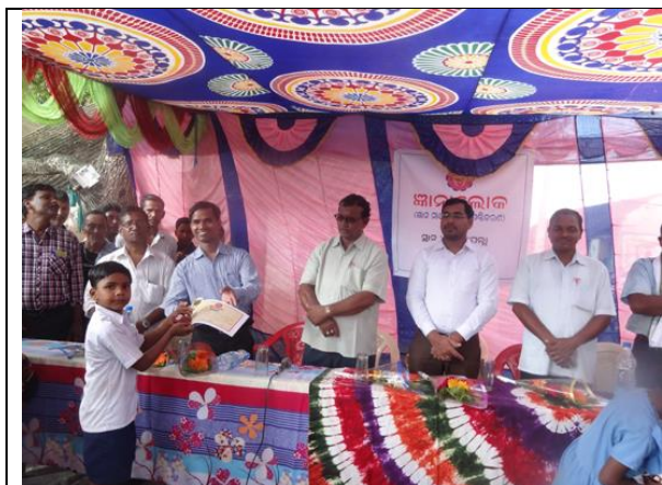
Prize distributed to winners at Karadapalla Primary School