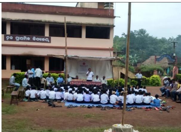
Education awareness at Haja Primary School