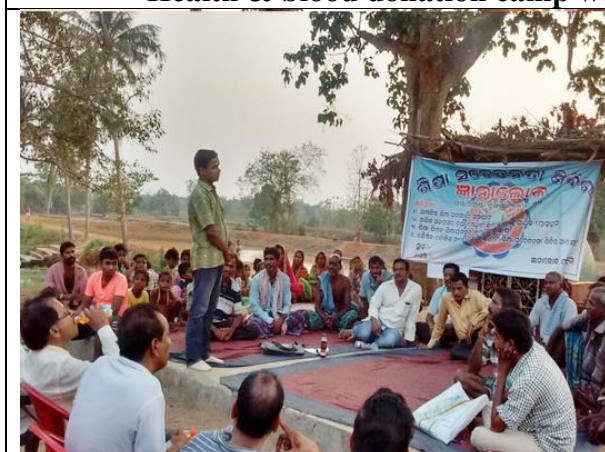
Parents' counselling at Karadapalla Village