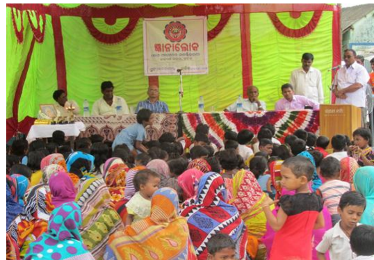
Education awareness & Parent counselling at Karadapalla Primary School