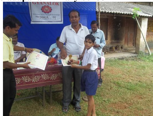
Prize distributed to winners at Haja Primary School