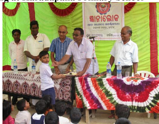
Prize distributed to winners at Karadapalla Primary School