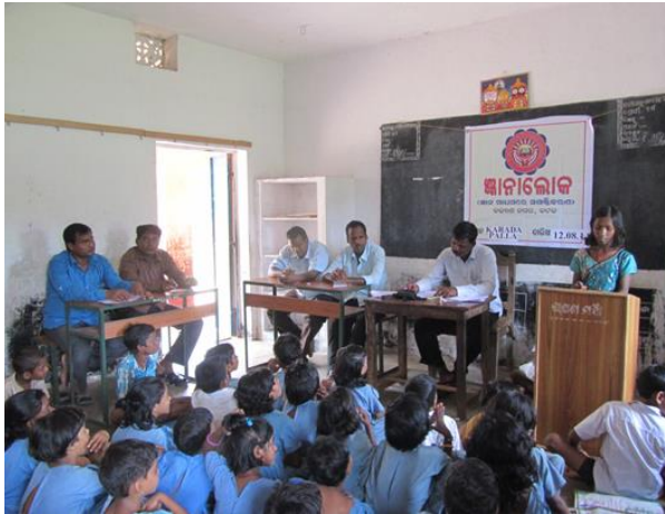
Student participate in different activity, Karadapalla