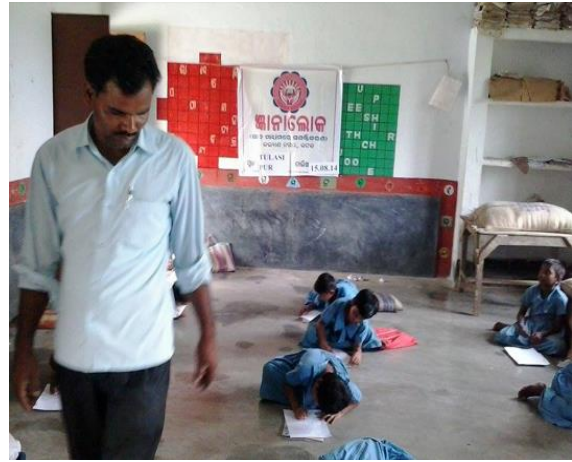
Student participate in different activity, Tulasipur