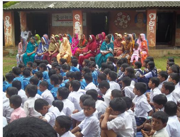
Education awareness & Parent counselling at Karadapalla Primary School